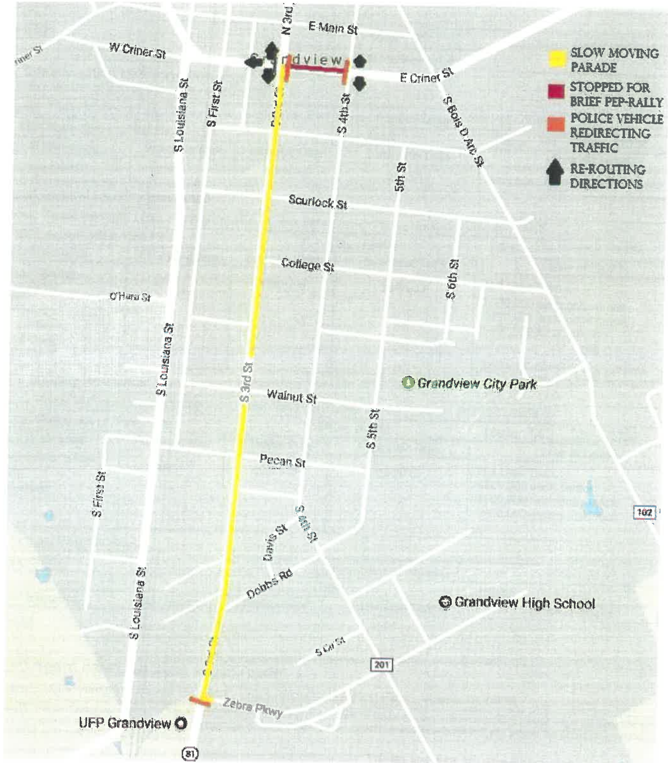
Exhibit C LOCATION MAP

Agreement No. _____ District # _____ Code Chart 64 # _____ Project: _____